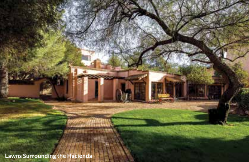
Lawns Surrounding the Hacienda