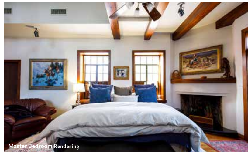
Master Bedroom Rendering